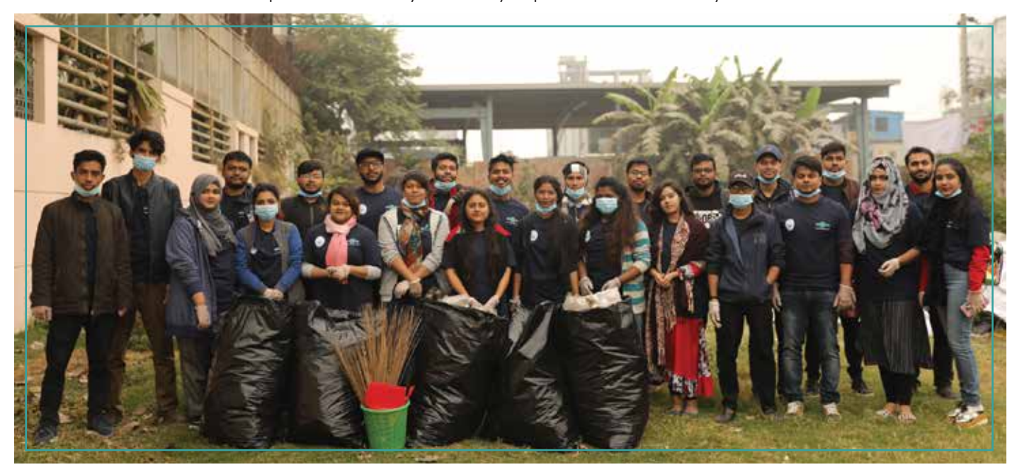
Members of North South University Earth Club take the Trash Tag Challenge 2019.

This event was one of the Club's many steps towards better living, and