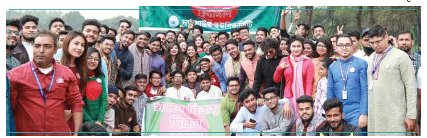
Students, faculty members, and other members of the NSU family pay homage to the martyrs at the National Memorial, Savar.